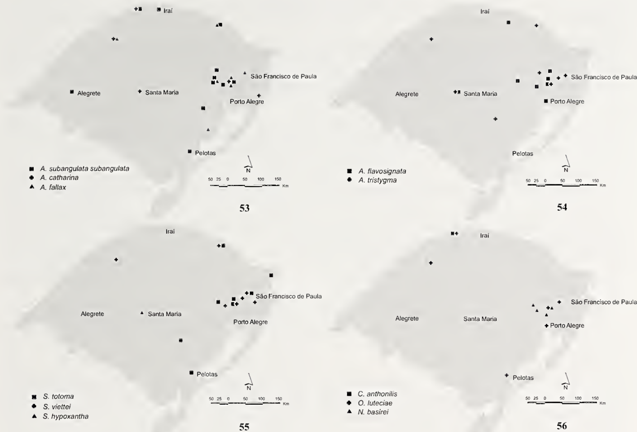
FIGS. 53–56. Distribution maps of Ceratocampinae of Rio Grande do Sul, Brazil. 53. Adeloneivaia subangulata subangulata , A. catharina , and A. fallax . 54. Adelowalkeria flavosignata and A. tristygma . 55. Scolesa totoma , S. viettei , and S. hypoxantha . 56. Citioica anthoniis , Oiticella luteciae , and Neocarnegia basirei .